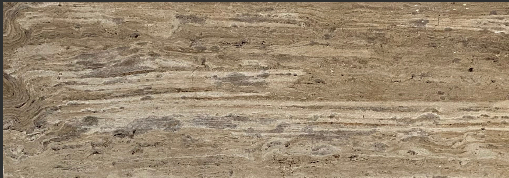
Polished Vein Cut