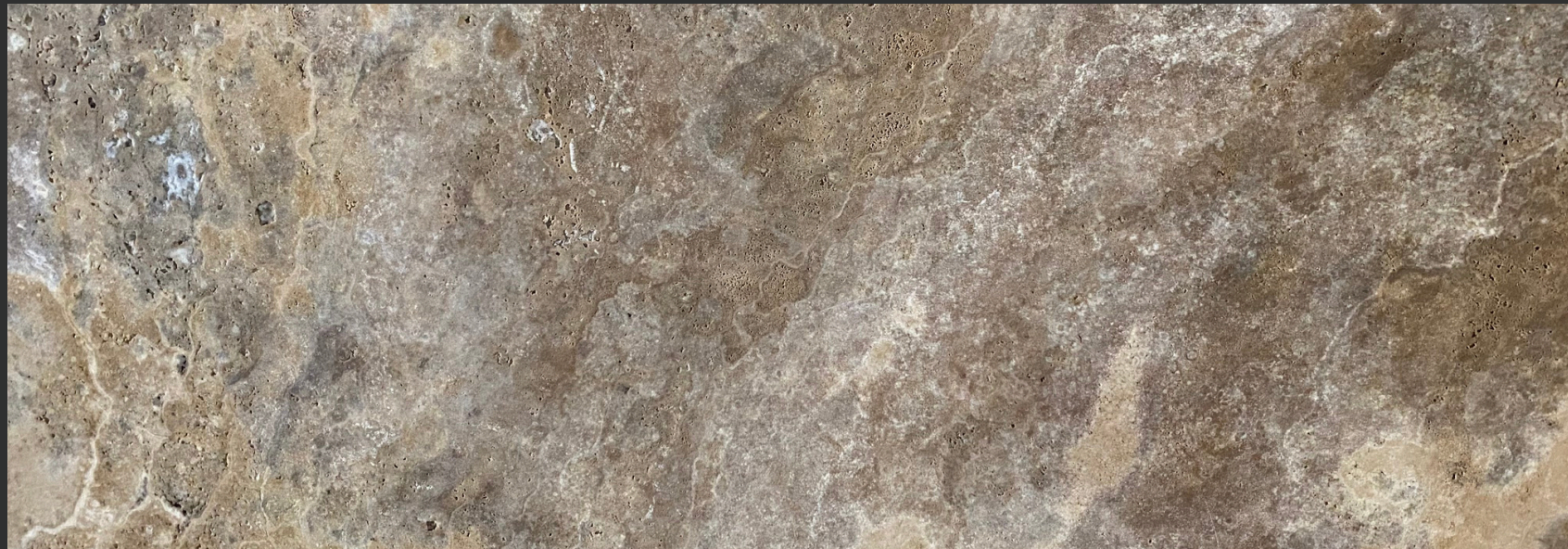
Polished Cross Cut